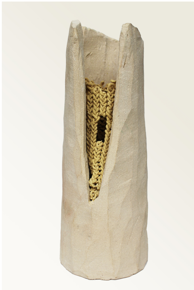
Untitled (2020) Paracas banding and ceramics 18 x 8cm USD 400