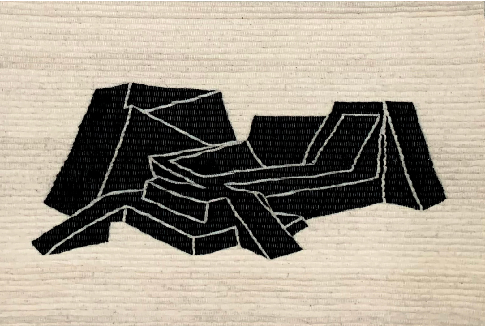
Huaca II (2020) Sheep wool 90 x 74cm USD 1600